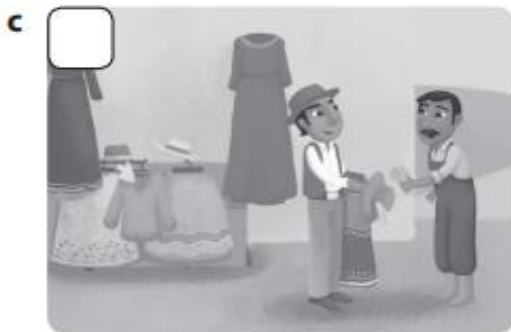
Farmer Flores sells the hat and dress. He buys the cow back.