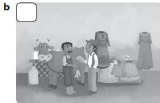
Farmer Flores sells the cow.