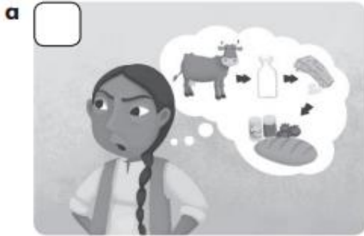
Mrs. Flores is angry.

A Read the sentences. Then number the events of the story in the correct order.